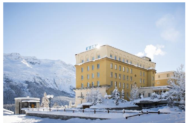
Lake Silvaplana & Kulm Hotel St. Moritz in winter

This winter season, for the first time ever, guests of the Kulm Hotel St. Moritz ( www.kulm.com ) can channel their inner 007 and learn how to kite ski at speed over the frozen lakes of the Upper Engadine thanks to the launch of a new two-night package.