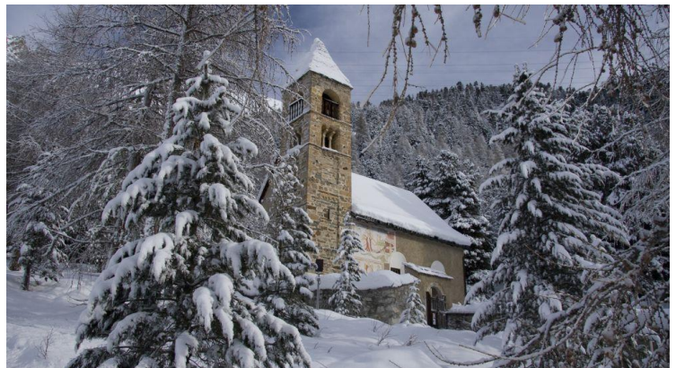
Cross-country skiing ; Sta. Maria Church in Pontresina among the woods

There are no downhill ski pistes here (aside from a kids' slope), so cross-country skiing enthusiasts prefer to base themselves in Pontresina, along with nature lovers (ibex winter observation walks take place in February and March), and those who simply want to wallow in the warm waters of winter wellness .