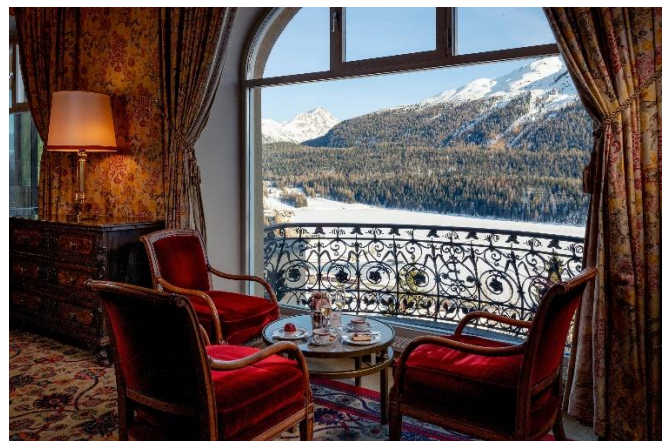
Mauro Colagreco in the K ; Lobby at Kulm Hotel St. Moritz

At the Kulm Hotel St. Moritz, many guests will have a first chance to sample the delights of the superstar chef Mauro Colagreco , who opened his first venture in the Alps in the property's