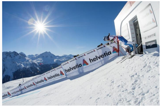
Snow Polo World Cup; Audi FIS Ski World Cup

In St. Moritz , the season starts with a bang with the Audi FIS Ski World Cup (11 & 12 December), followed in the New Year by two of the resort's most popular events the Snow Polo World Cup and the St. Moritz Gourmet Festival , which both launch on 28 January, with White Turf following fast on their heels with race dates on 6, 13 and 20 February.