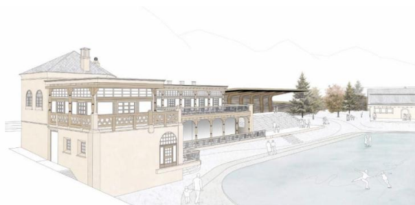
Historic image of the Ice Pavillon; artistic impression of the renovated Ice Pavillon

The two-storey Pavillon, built in 1905, is a synthesis of Art Nouveau and traditional Swiss style that has been classified as worthy of protection. Currently standing in disrepair and in danger of collapse, Lord Foster's new design will breathe new life into this architectural gem, which is also of historic importance having played a key part in the 1928 and 1948 Olympics held in St Moritz.