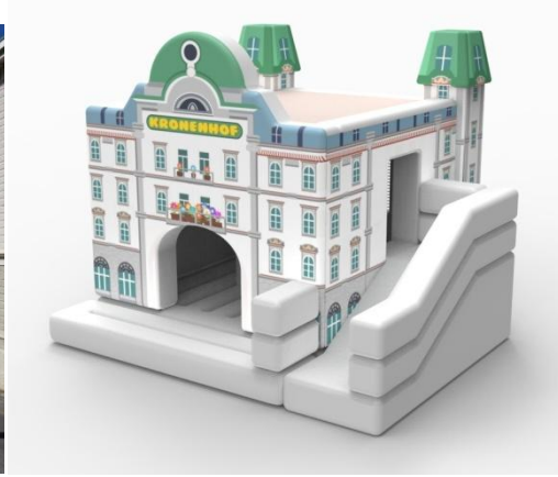
Grand Hotel Kronenhof; Grand Hotel Kronenhof bouncy castle

The mix of luxury and informality is carefully calibrated at these gracious ‘grande dame’ hotels, particularly when it comes to children. Young guests are warmly welcomed with the programme created just for them – it’s called V.I.K., which stands for ‘Very Important Kids’. Open to hotel residents from three to 12 years old, it includes free ice cream and squash all day long in any of the hotel restaurants, a children’s water world at each hotel, special children’s menus and a surprise package on arrival.