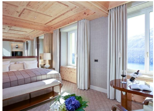
Kulm Spa St. Moritz outdoor pool; Kulm Hotel room with a view

For those who prefer to get active in the great outdoors, there are multiple, easily accessible opportunities to hike, trail run and bike in the mountains, as well as to swim, stand-up paddle board, sail and kitesurf on the various lakes of the Engadine valley.