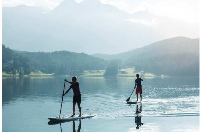
The Kulm Golf St Moritz par 3 course & the nearby Lake St Moritz

Switzerland announced recently that it would welcome double jabbed visitors, which makes the Engadine the perfect place to escape to this summer – especially now that the UK government has announced that travellers who are fully vaccinated will no longer have to self-isolate on return to England from amber list countries such as Switzerland.