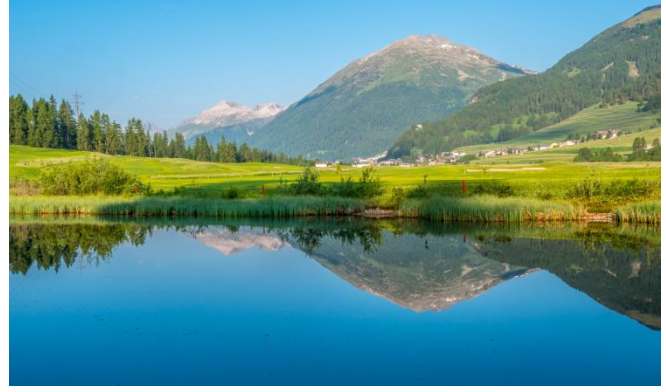
Samedan & Zuoz courses

Established in 1893 as the first 18-hole golf course in Switzerland, Samedan is a classic parkland course with something of a links feel to it courtesy of several gently undulating fairways and sloping greens. Set amongst ancient larches on the valley floor, the rolling terrain combines with a host of water hazards to ensure a challenging round of golf despite its forgiving broad fairways and modest rough.